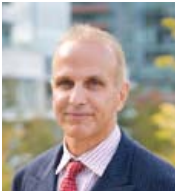
Editor: Neil Maedel Uncompromising analysis exclusive advice beginning 1987.